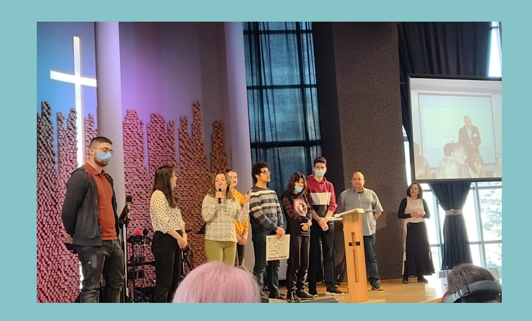
Students from Varna Baptist Church presenting about the work of the student ministry in a partner church.