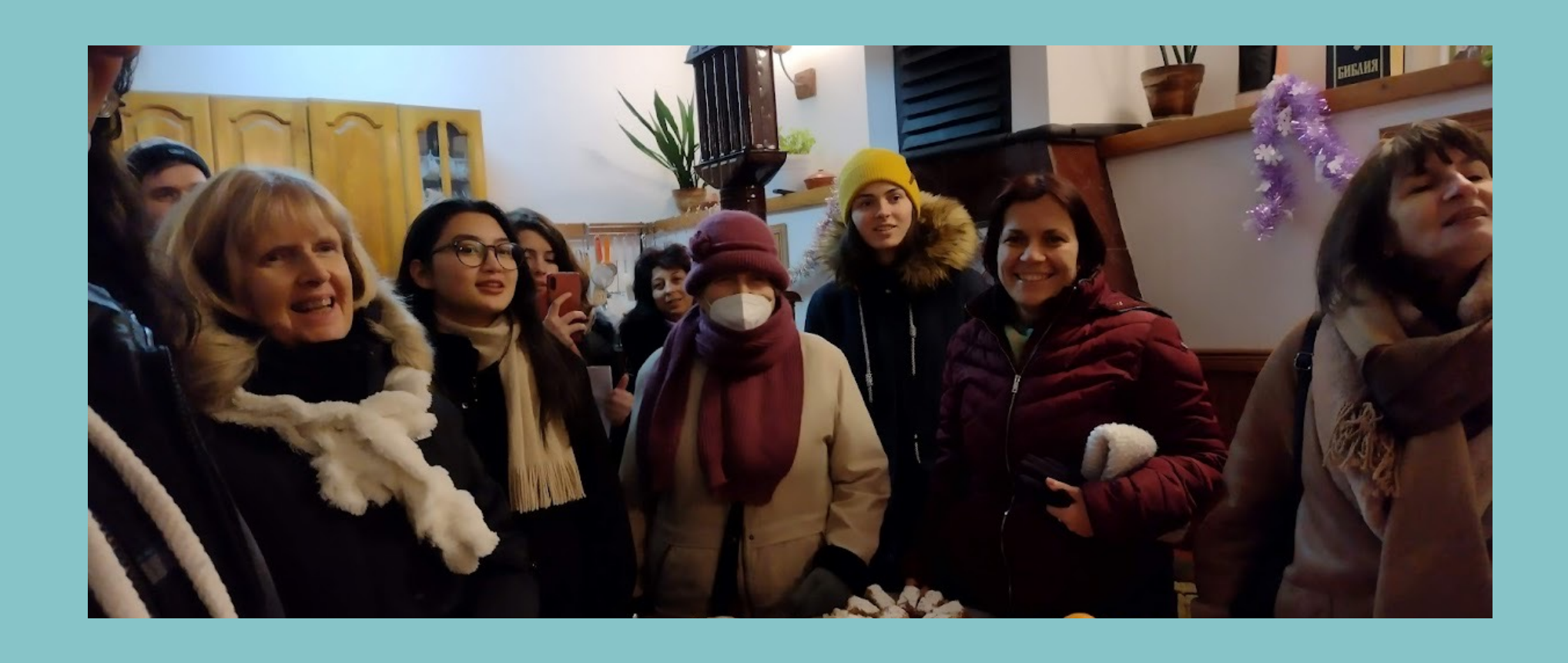
The special church Christmas tradition of carol singing on Christmas Eve.