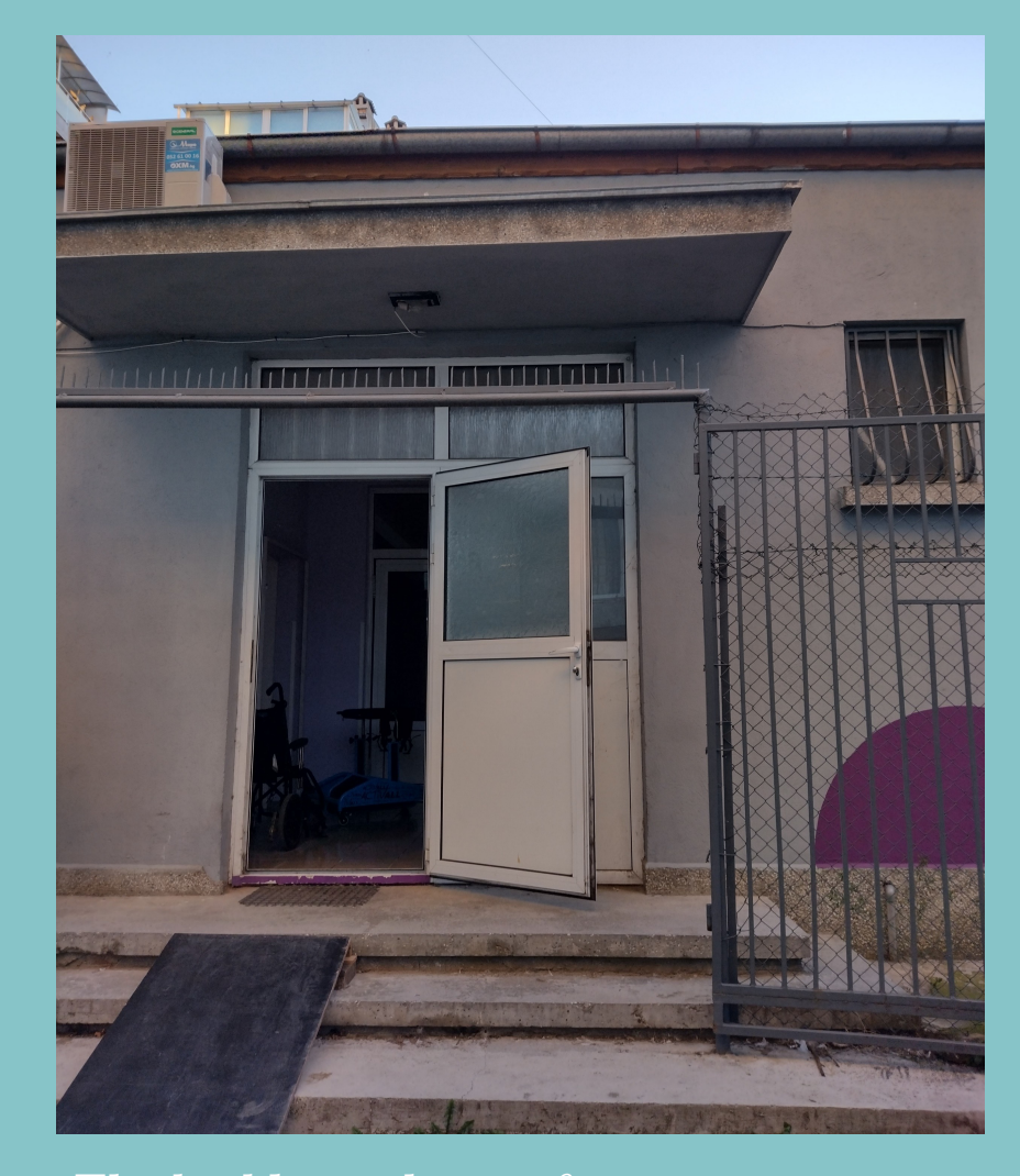
The building where refugees are staying. This building was previously used for the foster care ministry but has been cleared to make space for the refugee families.