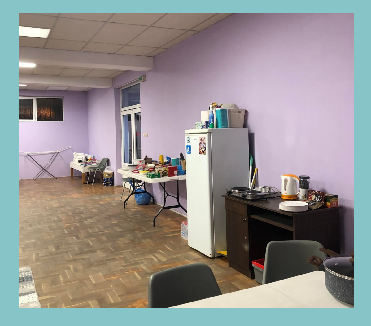
Inside the temporary accommodation for refugees in the church.