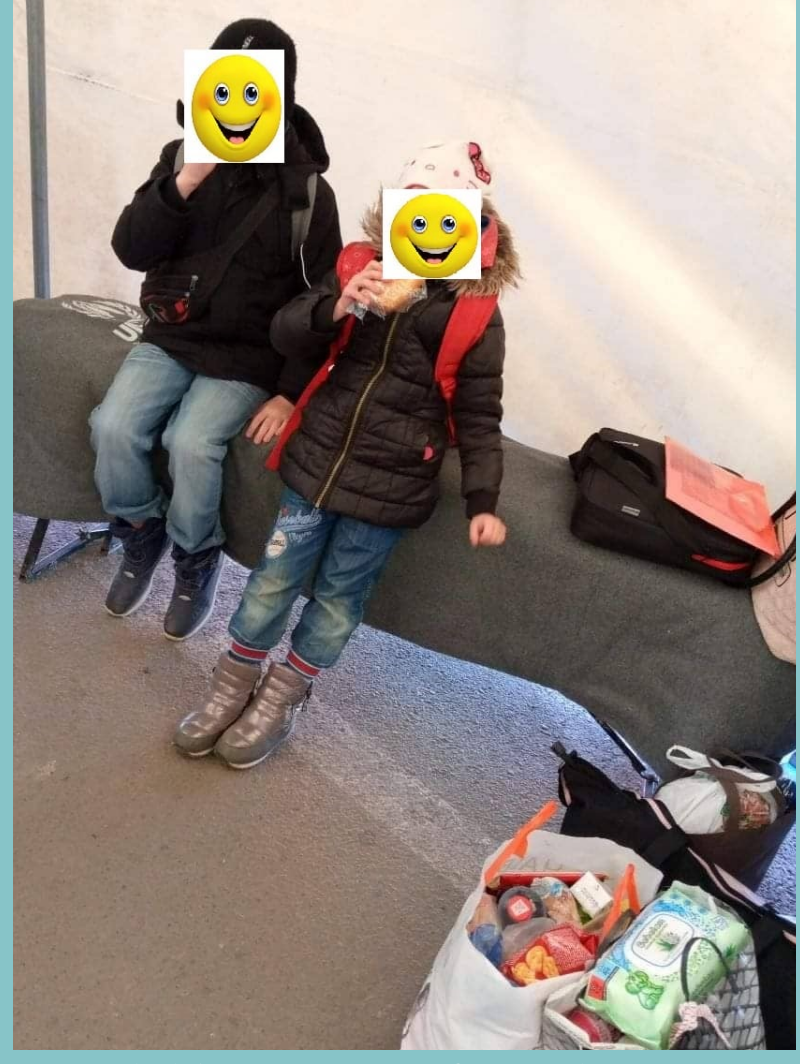
Two children waiting for a place to stay after arriving in Varna. They came with volunteers back to the church.